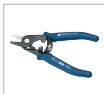
Jacket remover JR-M03