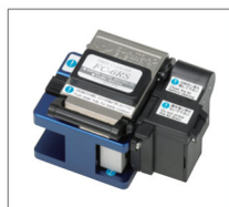
Table-top cleaver FC-6 / FC-6R series