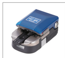
Handy cleaver FC-8R series