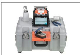
Carrying case with worktable CC-72